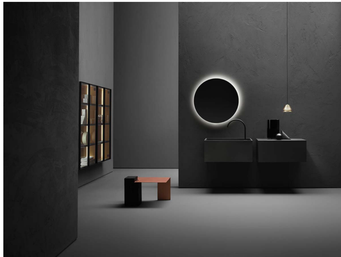
Falper Minimum by Victor Vasilev

Inspired by the art of Donald Judd , the American artist always associated with Minimalism, Victor Vasilev has created a versatile, modular system for Falper Minimum , offering personalization and containing wall-mounted washstands, self-supporting shelves and cabinets, available in different sizes and compositions.